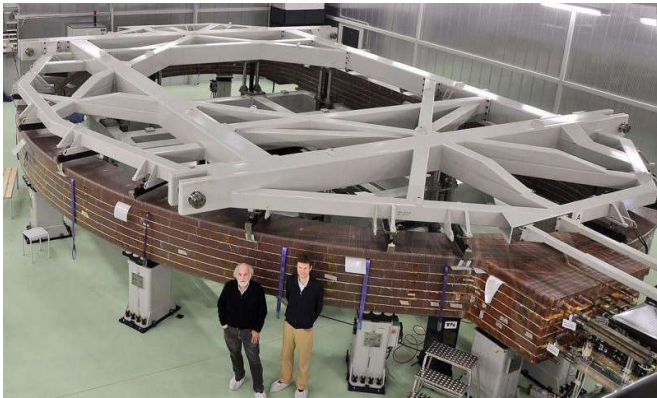
A. Bonito-Oliva, F4E Project Manager for Magnets, R. Harrison, F4E Technical Officer for Magnets, standing next to Europe's first Toroidal Field coil winding pack. ASG Facilities, February 2016.

Powerful superconducting magnets will confine ITER's plasma which is expected to reach 150 million °C. Basically, an impressive magnetic shield will entrap the hot gas and keep it away from the walls of the vessel of the world's biggest fusion machine. Discover the manufacturing progress of ITER's first Toroidal Field coil. It is 14 m high, 9 m wide and 1 m thick. Its weight is approximately 110 tonnes which compares to that of a Boeing 747!